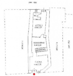
Via San Sebastiano PIANO TERRA