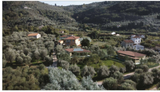
RENDERING FOTOINSERITO - N°2