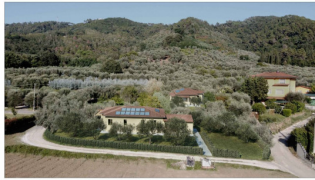
RENDERING FOTOINSERITO - N°1